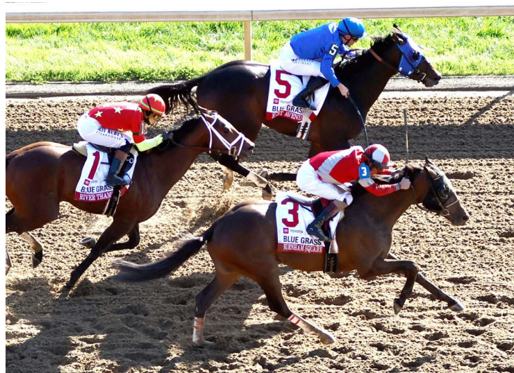
East Avenue (rail) bounced back to just miss behind Burnham Square in the Blue Grass