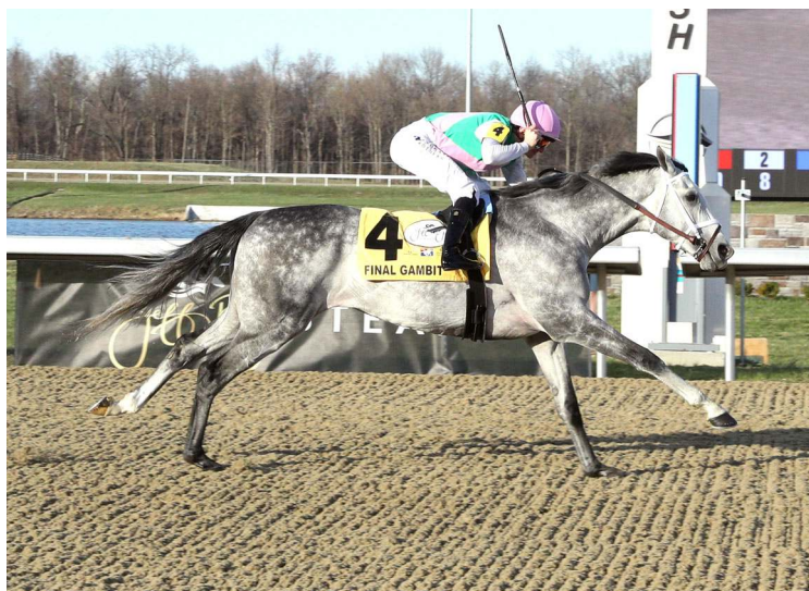
Final Gambit