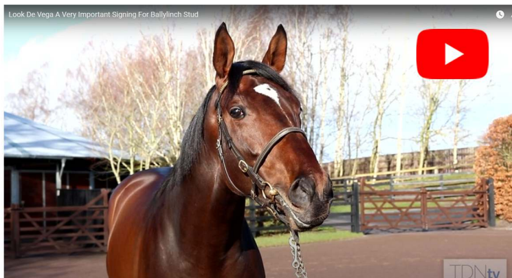
Look De Vega A Very Important Signing For Ballylinch Stud