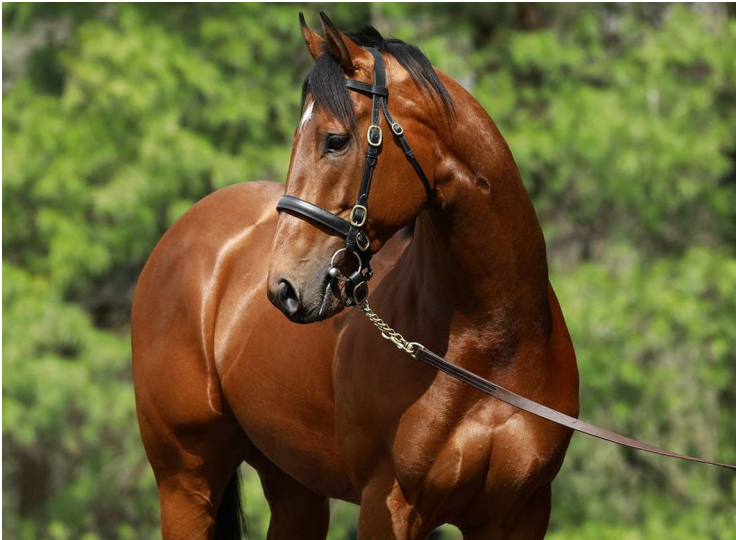
Practical Joke