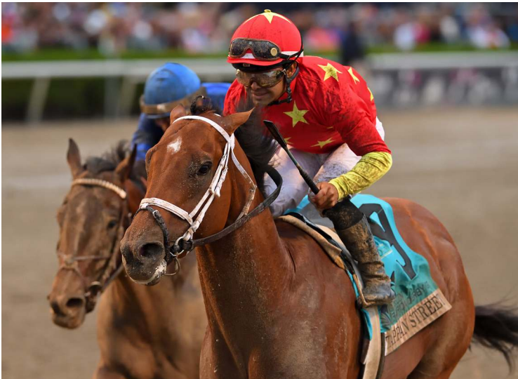
Tappan Street got the better of Sovereignty in the GI Curlin Florida Derby

Cons: Falling in love with a deep closer for the Derby can be hazardous to your bankroll. Speed-centric horses who raced either on the lead or just off it crossed the finish wire first in every Derby between 2014 and 2021 (although two were DQ'd). Yes, horses from off the pace have won the last three Derbies (Rich Strike in 2022 and Mage in 2023 rallied from well back while Mystik Dan won in 2024 with an inside stalk). But it's still difficult to get behind one-run tailgate types like Sovereignty knowing that the fates for well-meant closers in the Derby so often end up being pace- and trip-dependent.