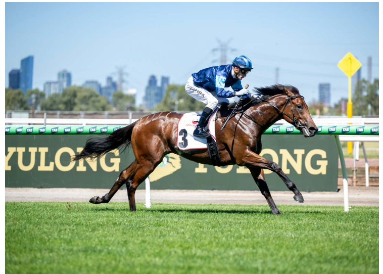
Vinrock