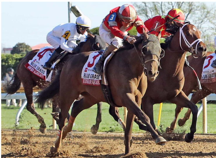
The Kentucky Derby-bound Burnham Square became the fifth Grade I winner for Lane's End's Liam's Map in the Toyota Blue Grass S.

Italics indicate new activity, statistics include Northern Hemisphere results only. Want to promote your stallion? Email suefinley@thoroughbreddailynews.com .