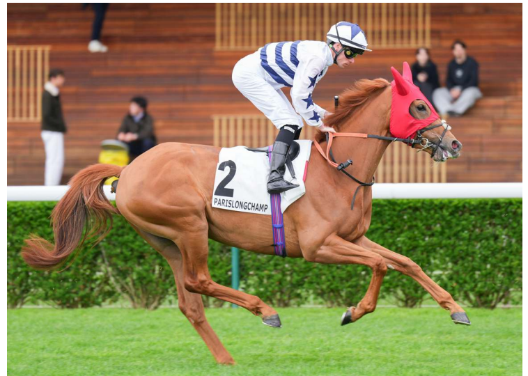
Shes Perfect: a graduate of the British EBF 2yo Series

Also Ran: Rayevka (Ire), Miss Lamai (Ire), Apollo Fountain (GB), King Of Light (GB), The Strikin Viking (Ire), Mehmist (Fr), Une Pointure (Fr).