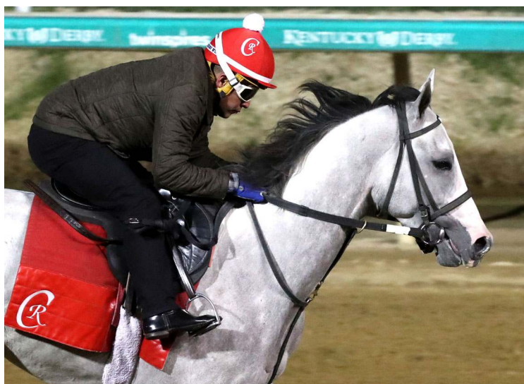
Sandman