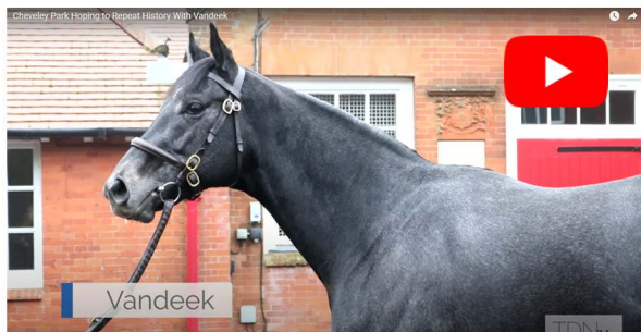
Cheveley Park Hoping to Repeat History With Vandeek