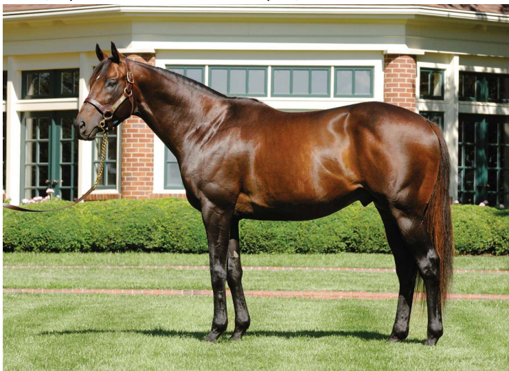
Mineshaft | Lane's End

From 20 crops to his credit, Mineshaft 's progeny have earned over $101-million in purses with some of his top horses including G1 Saudi Cup hero Senor Buscador --who accounts for over $12-million of that tally--who now stands at the same farm and will carry his sire's banner. His eight Grade I winners include the late Effinex; MGISW It's Tricky, dam of MGSW & GISP Enticed ( Medaglia d'Oro ); True Timber; Dialed In , himself among leading sires; Discreetly Mine, who stands in Uruguay; Weep No More, a producer of winners in Japan; and Bond Holder.