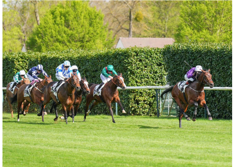
Arizona Blaze | Scoop Dyga