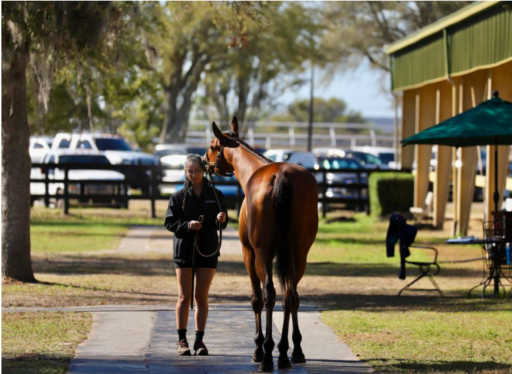
OBS sales grounds | OBS