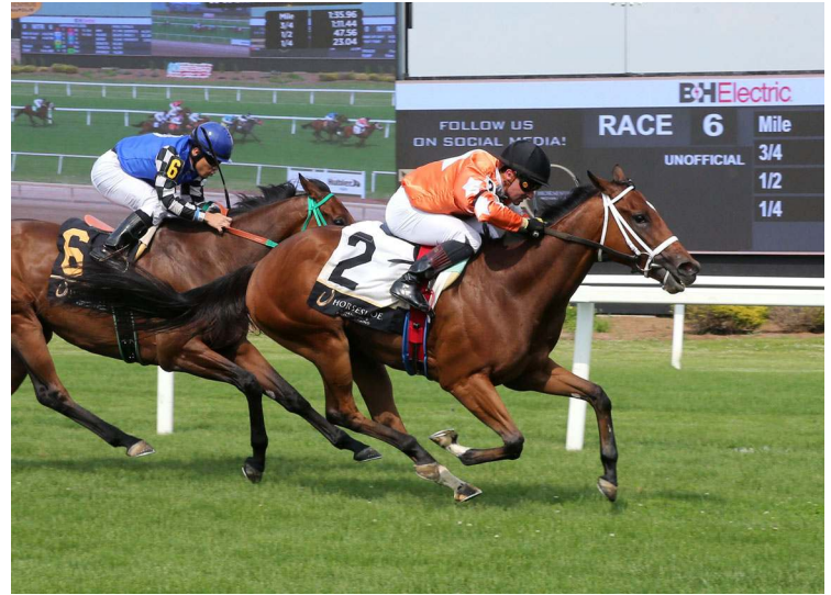
Starship Athena