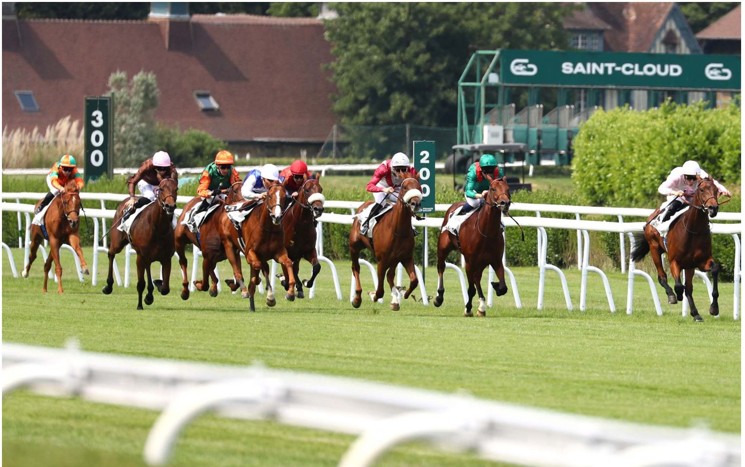
Segall | Scoop Dyga