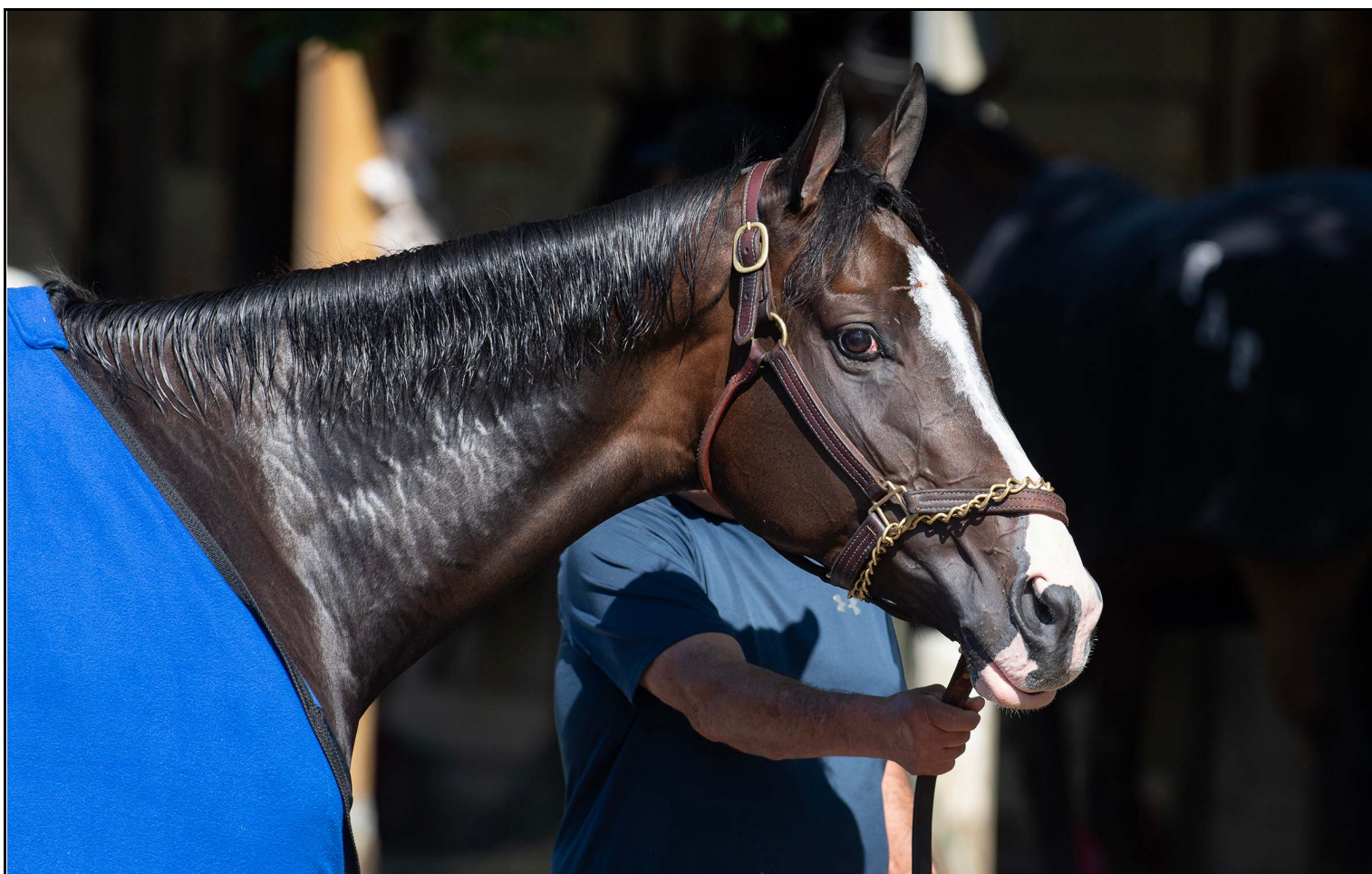
Kentucky Oaks winner Good Cheer is entered in Friday's GI Acorn Stakes, one of 16 graded races scheduled this weekend at the Belmont Stakes Racing Festival held at Saratoga