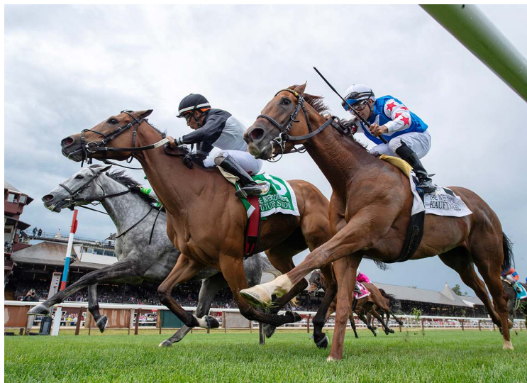
Future Is Now (middle) winning the 2024 Intercontinental in a wild finish

Admission gates open at 11 a.m. with first post scheduled for 12:40 p.m. for the GI Beverly R. Steinman Hurdle Handicap over the fences. The first 10,000 fans to enter with paid admission will receive a free, white baseball cap featuring the NYTB and 2025 Belmont Stakes logos.