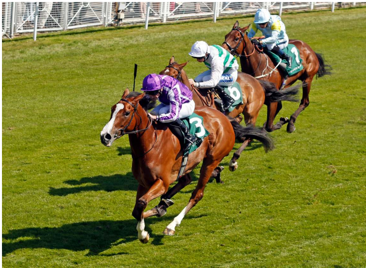
Minnie Hauk, a 4/1 shot for the Oaks with Betfred after winning the Cheshire Oaks

Cheshire Oaks heroine Minnie Hauk ( Frankel ) is the likely mount of Ryan Moore in the Betfred Oaks, according to trainer Aidan O'Brien, with the Ballydoyle team also set to call upon the services of Wayne Lordan and Colin Keane on a busy Classic weekend at Epsom.