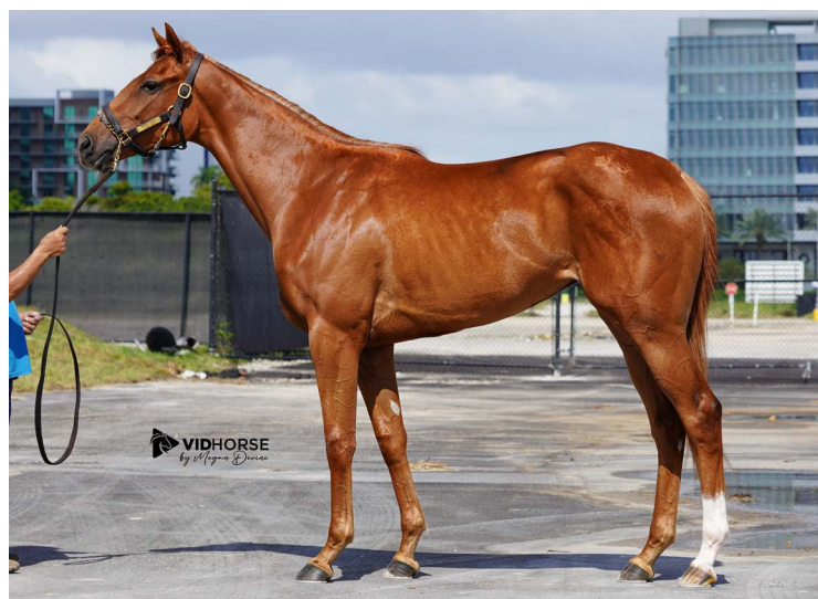
Strada Del Sogno