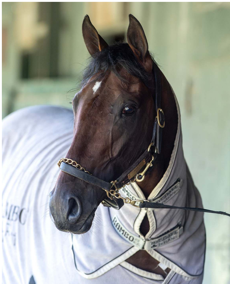
Baeza at the Spa

Grandview Equine shares ownership in the horse.