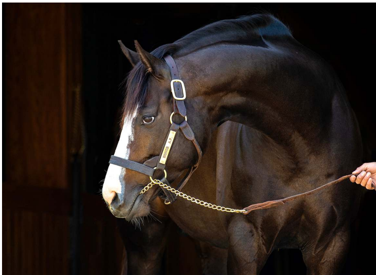
Honor A.P.

Higher Power (Medaglia d'Oro) , Darby Dan Farm, $5,000 158 foals of racing age/15 winners/0 black-type winners 10-Saratoga, 5:47 p.m. EDT, Msw 1 1/16mT, The Saint, 15-1 $30,000 FTN MIX wnl; $25,000 KEE JAN wnl; $80,000 KEE SEP yrl