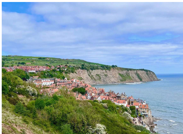
The Yorkshire coastline will provide picturesque views along the route