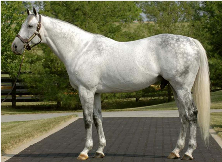
Unbridled's Song

The foals delivered by Unbridled Elaine after her transfer to Darley included triple graded stakes winner Etched (Forestry); G2 Champagne Stakes winner Emotionless (Shamardal); and GIII Sham Stakes winner Out of Bounds (Discreet Cat). Two of Unbridled Elaine's half-sisters, meanwhile, had further confirmed the startling powers inherited from Carols Folly. One produced triple Grade II winner Lead Story (Editor's Note); while Glitter Woman herself gave us GI Suburban Handicap winner Political Force (by Unbridled Elaine's own sire).