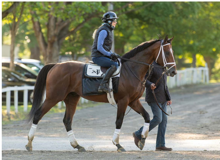
Pletcher's Belmont entrant Uncaged Tuesday morning