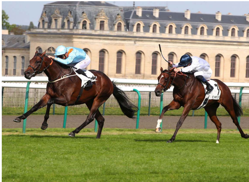
The Charlie Johnston-trained Lazy Griff wins the G2 Prix de Conde Scoop Dyga

A sire very much on the rise who falls between these two stools is Mehmas, who was never out of the first three in his eight starts but raced only in his juvenile season.