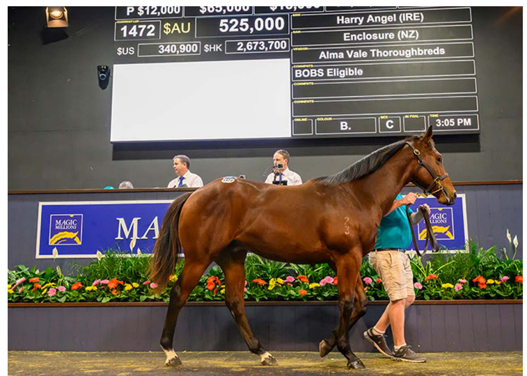
The Harry Angel colt who brought major pinhooking profit | Magic Millions

The 2025 Magic Millions National Yearling Sale concluded on Tuesday with solid results despite a challenging market. Harry Angel emerged as the standout sire on Day 2, highlighted by a colt that sold for A$525,000, while Extreme Choice continued his strong commercial run, siring three of the top five lots overall.