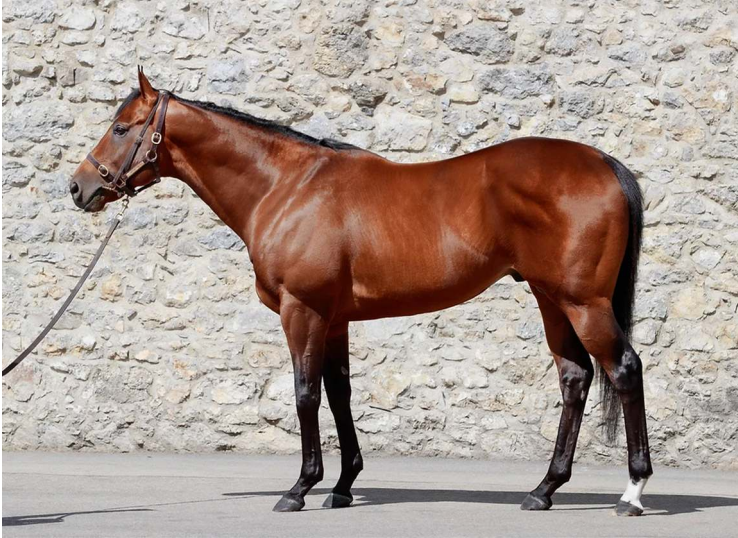
Starman has runners in the UK and Ireland