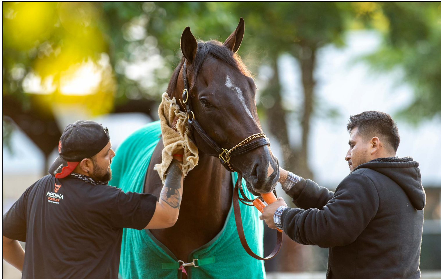
Derby winner Sovereignty multitasks by snacking on carrots during a bath after galloping Tuesday morning at Saratoga