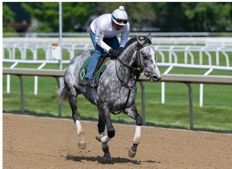
Sterling Silver training at the Spa earlier this week