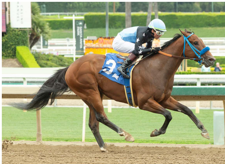
Thirty Two Chunk