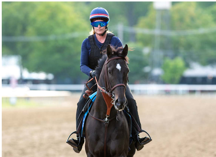
Belmont contender Rodriguez this week

The last Peter Pan winner to come back and take the Belmont was Arcangelo (Arrogate), who won in 2023 at Belmont Park at 1 1/2 miles.